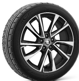
17" Procyon black bright alloys