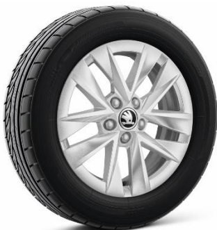
15" Rotare silver alloy wheels