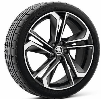
18" Libra black alloy wheels (optional)

Škoda reserves the right to make changes to specifications, colours and prices without notice. While we make every effort to ensure that specifications are accurate at the time of publication, you should always check with your Škoda dealer for the latest information.