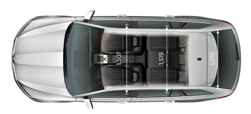
Technical drawing shown is Superb Style