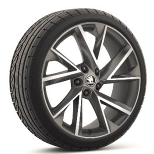
19" Vega alloy wheels

Škoda reserves the right to make changes to specifications, colours and prices without notice. Whilst we make every effort to ensure that specifications are accurate at the time of publication, you should always check with your Škoda dealer for the latest information.