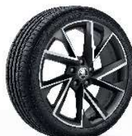
19" 'VEGA' Alloys

* Fuel consumption values obtained using NEDC Standard and are based on European models.