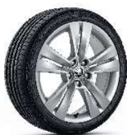
18" 'MYTIKAS' Alloys