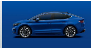
Energy Blue Solid