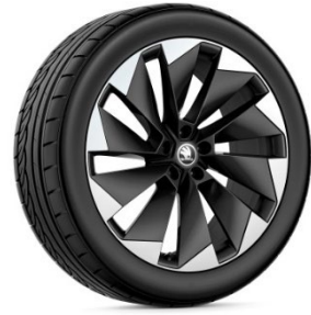
21" Supernova alloy wheels (+$1,500)

Škoda reserves the right to make changes to specifications, colours and prices without notice. Whilst we make every effort to ensure that specifications are accurate at the time of publication, you should always check with your Škoda dealer for the latest information.