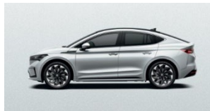
Moon White Metallic