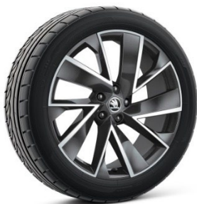
20" Vega alloy wheels