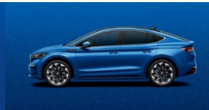
Race Blue Metallic