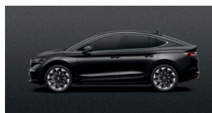
Magic Black Metallic