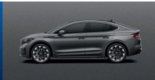
Graphite Grey Metallic