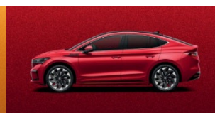
Velvet Red Metallic (+$1,000)