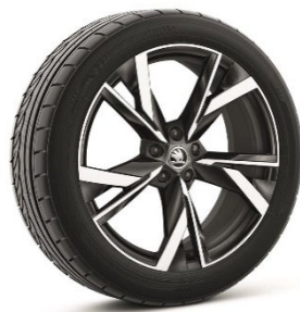
20" Taurus alloy wheels