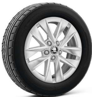
15" Rotare silver alloy wheels