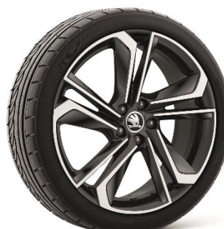
18" Libra alloy wheels (+$2,255)

Škoda reserves the right to make changes to specifications, colours and prices without notice. Whilst we make every effort to ensure that specifications are accurate at the time of publication, you should always check with your Škoda dealer for the latest information.