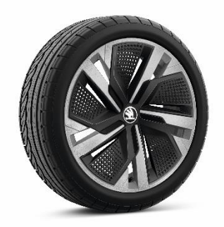
18" Ursa aero silver alloys with aero trim