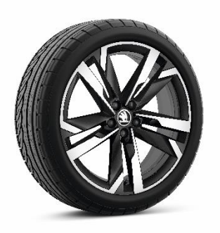
18" Ursa MC black, diamond cut alloys

Škoda reserves the right to make changes to specifications, colours and prices without notice. While we make every effort to ensure that specifications are accurate at the time of publication, you should always check with your Škoda dealer for the latest information.