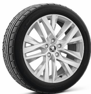
18" Lerna silver alloy wheels