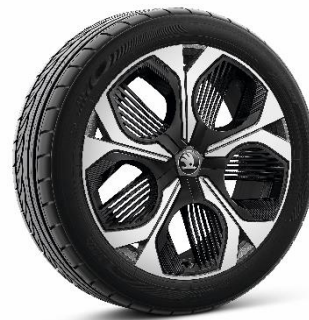
19" Elias anthracite alloy wheels

Škoda reserves the right to make changes to specifications, colours and prices without notice. While we make every effort to ensure that specifications are accurate at the time of publication, you should always check with your Škoda dealer for the latest information.