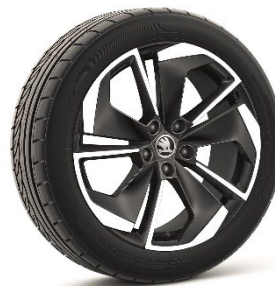
18" Comet alloy wheels