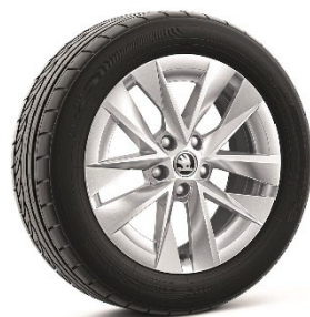
17" Rotare alloy wheels