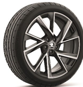
18" Vega alloy wheels

Škoda reserves the right to make changes to specifications, colours and prices without notice. Whilst we make every effort to ensure that specifications are accurate at the time of publication, you should always check with your Škoda dealer for the latest information.