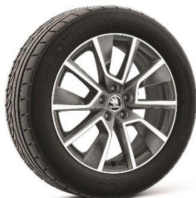
17" Braga alloy wheels