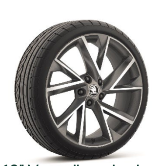
19" Vega alloy wheels

Škoda reserves the right to make changes to specifications, colours and prices without notice. Whilst we make every effort to ensure that specifications are accurate at the time of publication, you should always check with your Škoda dealer for the latest information.